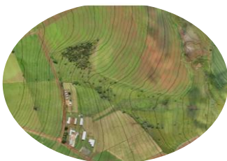
Geo-referenced Image & Contours