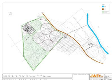
Site Survey & Design Layout