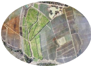
Geo-referenced Ortho Mosaic Image